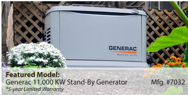
Featured Model: Generac 11,000 KW Stand-By Generator Mfg. #7032 *5-year Limited Warranty

How do stand-by generators work? Stand-by generators offer fully automatic operation. They're connected to an Automatic Transfer Switch (ATS), which is connected to the main electric panel. When utility power is lost, the ATS activates, collects power from the generator, and sends it back to the main panel. When utility power is restored, the ATS automatically shuts off and reverts the power source back to the main electrical panel.