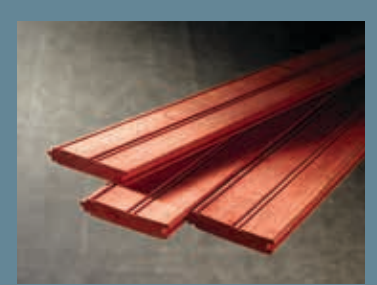
T and G Ceiling boards bave a Center Bead profile on one face