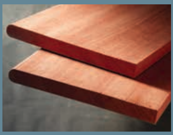
Bullnose Stair Treads