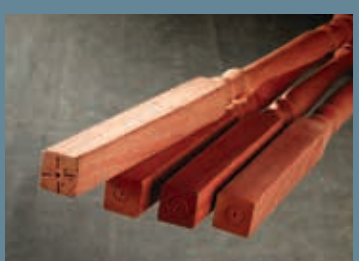
2x2 Balusters are available in S4S/ E4E or Turned Colonial profiles